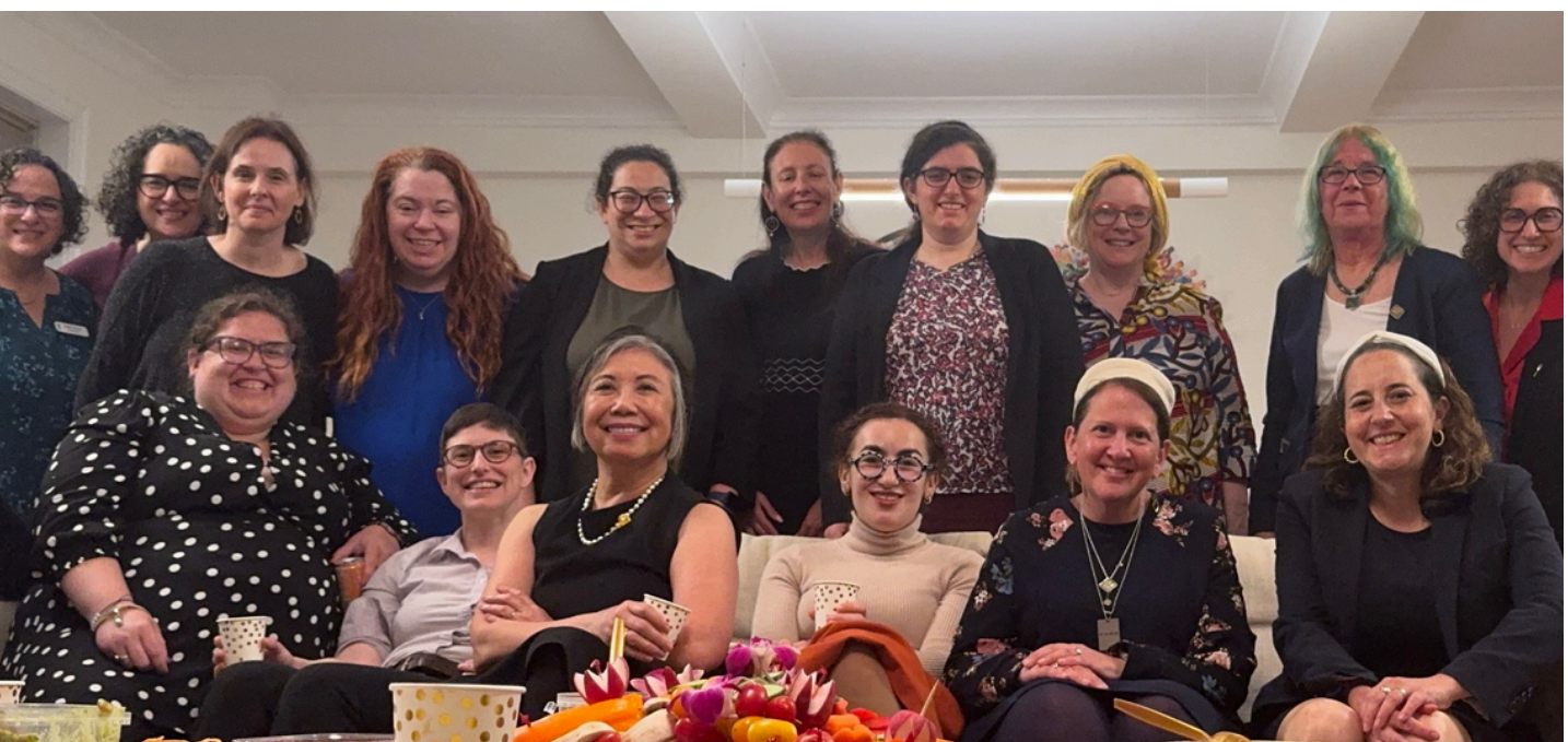
Celebrating 40 Years of Women in our RA

At its heart, our RA is a place where every member's voice helps shape who we are and who we become. We are grateful to the many colleagues who devoted countless hours, ideas, and energy to strengthening our collective work.