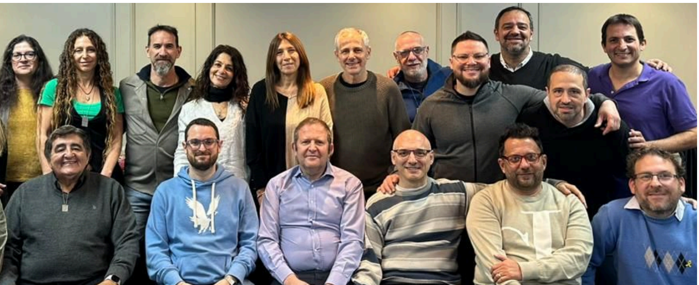
Members at LARA Kallah

This year, the Rabbinic Training Institute (RTI) was reimagined as a partnership between our RA and JTS. A new Family Systems Track Intensive offered colleagues strategies to examine the dynamics within our own families and the diverse communities we serve. From our Small Congregations Conference in Chicago to the NJ Regional Retreat, each gathering offered opportunities to strengthen our unique rabbimates and renewed our shared sense of purpose.