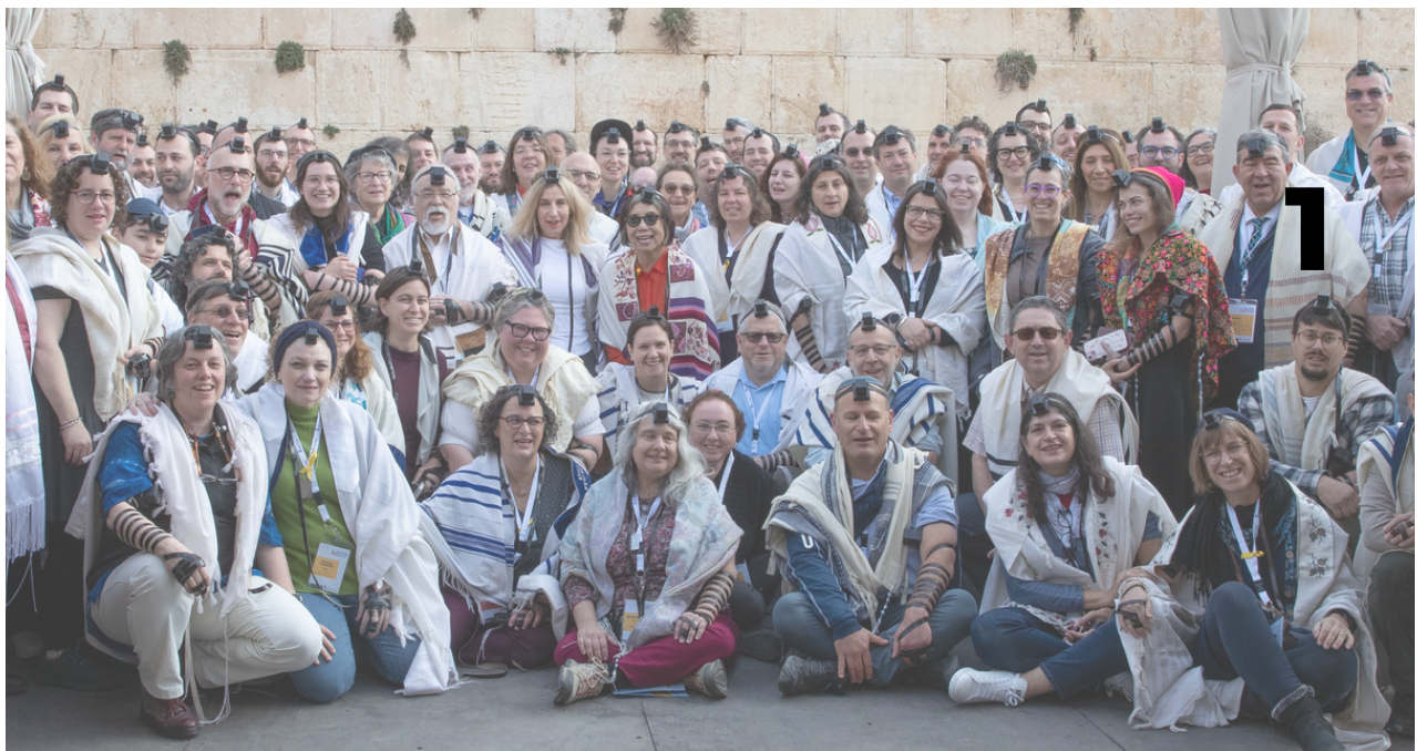
Israel Convention Participants at Kotel