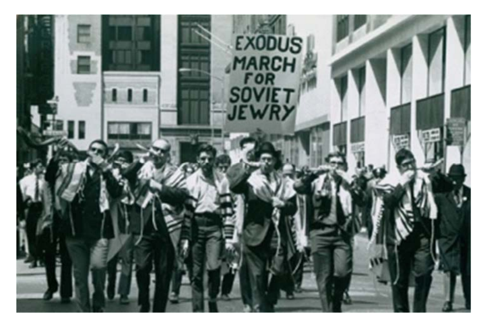
Exodus March for Soviet Jewry, New York City April 1970.5