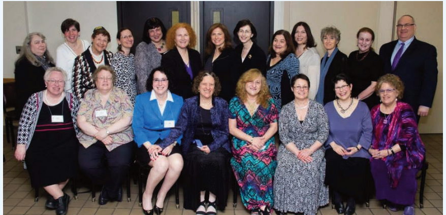
RA Annual Meeting, April 2015. Honoring the first women to enter JTS Rabbinical School in Fall 1984 and the first to join the Rabbinical Assembly.

This structural change was endorsed in November 2014 by the 19 regional presidents. Presently, almost all of the 53 rabbinic cohorts have either held or scheduled a first meeting. New colleagues are being welcomed into their new RA region/cluster and each of the RA subdivisions is preparing to